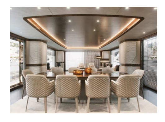
Interior volume of 299 gross tons