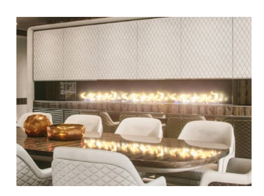
Main saloon fireplace