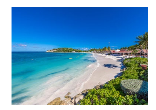
Transatlantic range of 3,100 nm @ 10 knots