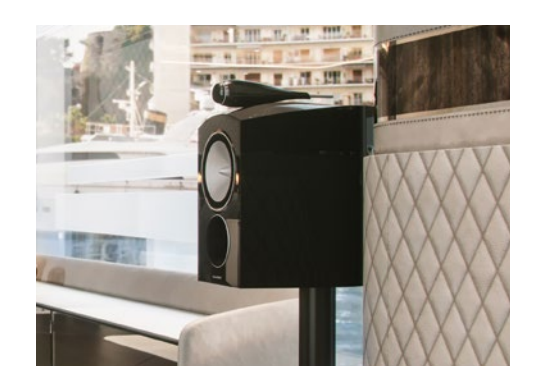
High-end audio by Bowers & Wilkins