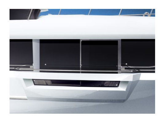
Owner's stateroom with two fixed balconies