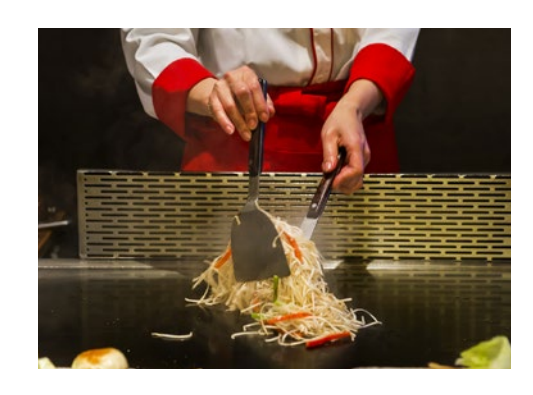
Japanese Teppanyaki on sundeck