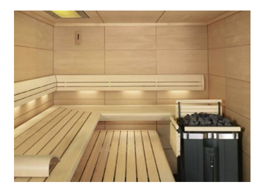
Beach club with sauna