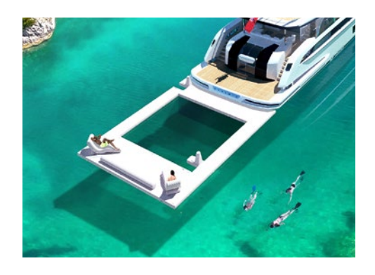
Fun Air inflatable pool, 5 x 6 meters (16' 5" x 19' 8")